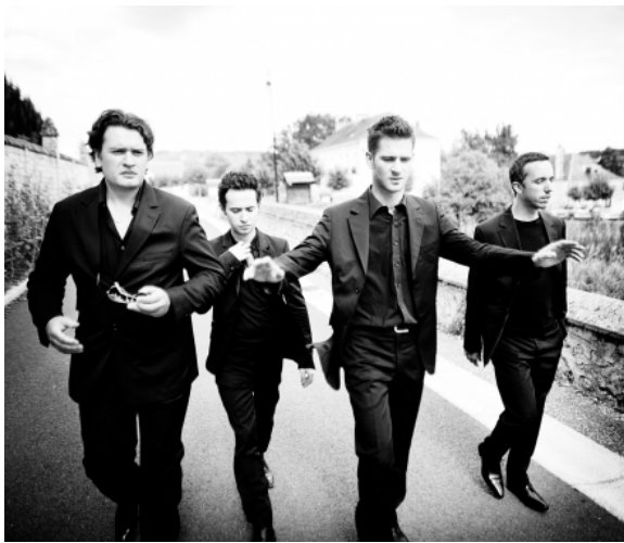
Quartar Ebène

Located in the James Madison Building, Montpelier Room, Sixth floor Presented by the Library’s Center for the Book